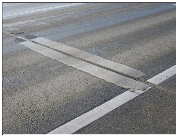
5 month inspection 12/11/2013

Reinspection Notes: Following five days of subfreezing temperatures, a five-month site reinspection showed no shrinkage, no cracking, and no delamination. Follow-up Inspection photos show the repair solidly in place after 4 years.