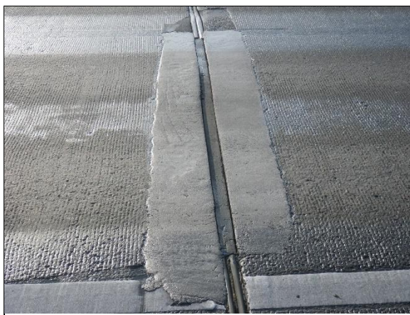
5 month inspection 12/11/2013